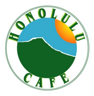
Coffee • Tea Breakfast • Lunch • Catering